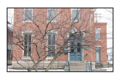
Table 18 Emerson House 710 Brown Street, Lafayette built in 1869, received plaque in 1992 Italianate style

Morrison—Hovey—Dickman Townhouses 420 N. 7th Street, Lafayette built in 1856, received plaque in 1991 Tudor style